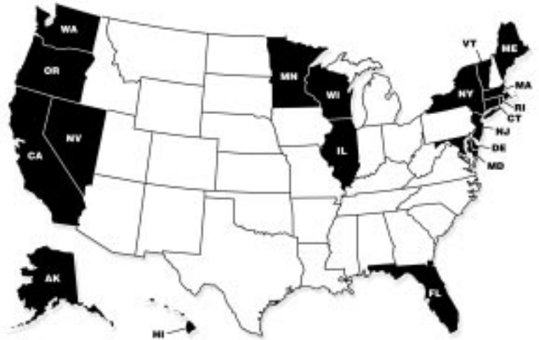
States with minimum wage above the federal level